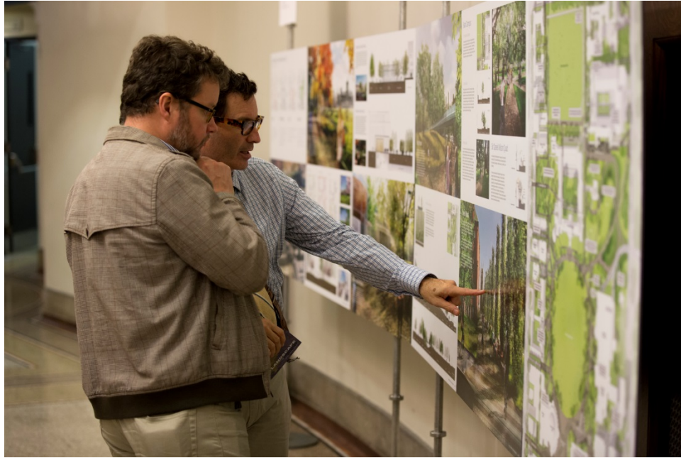
Examining the display panels at Convocation Hall on September 28 th

aim to encourage continued dialogue about the project. An introductory panel at this exhibit encouraged viewers to send their questions and comments to the project's dedicated email address ( landmark.committee@utoronto.ca ).